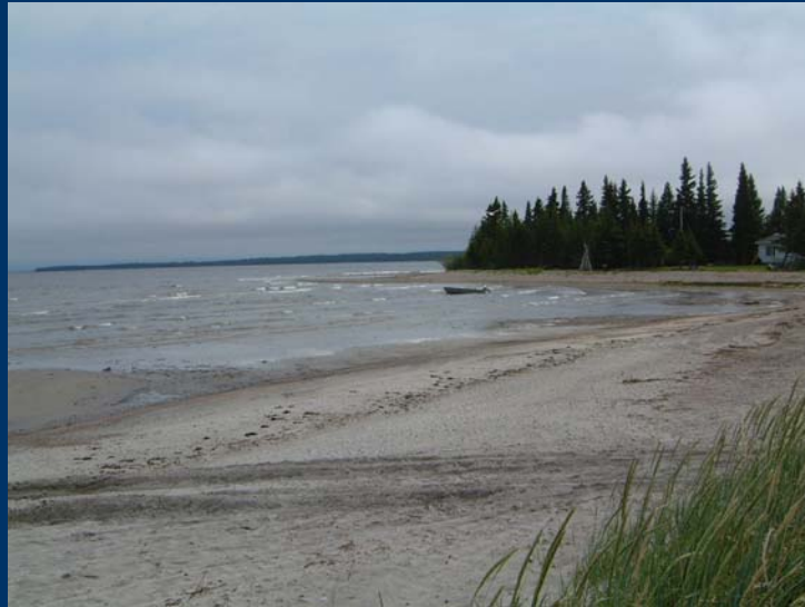
North West River