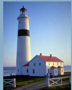
Point Amour Lighthouse