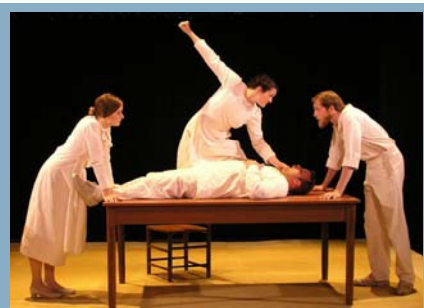
Theatre Newfoundland Labrador Presents "Tempting Providence"

There are still tremendous opportunities in traditional fisheries such as shrimp, crab, lobster, flounder, haddock, herring, mackerel, seal and others, provided the species are properly managed. Results show that past conservation and management practices of local fishers proved beneficial (e.g. lobster conservation efforts in Bonne Bay). Provincial management of Atlantic salmon, Eastern brook trout and Arctic char was achieved and these provide increased opportunities for out-of-province sports anglers.