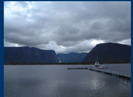
Western Brook Pond

whenever possible. Corner Brook-Rocky Harbour regionally offers the amenities of an urban community with the manageable lifestyle of a rural area that is recognized throughout the world as a preferred location and place of choice to live, work and play!