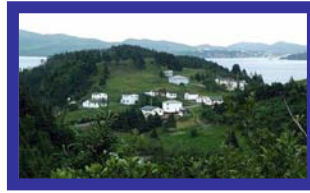
Mooring Cove – Greater Lamaline Area Development Association