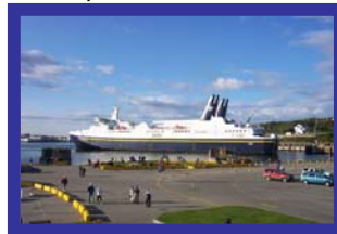
Port aux Basques – Zone 10 Regional Economic Development Board