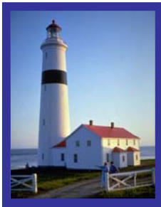
Lighthouse - Point Amour – Tourism, Culture & Recreation