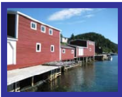
Croque Waterfront – Natasha Way