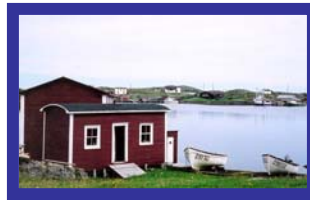
Change Islands – Lynn Pardy